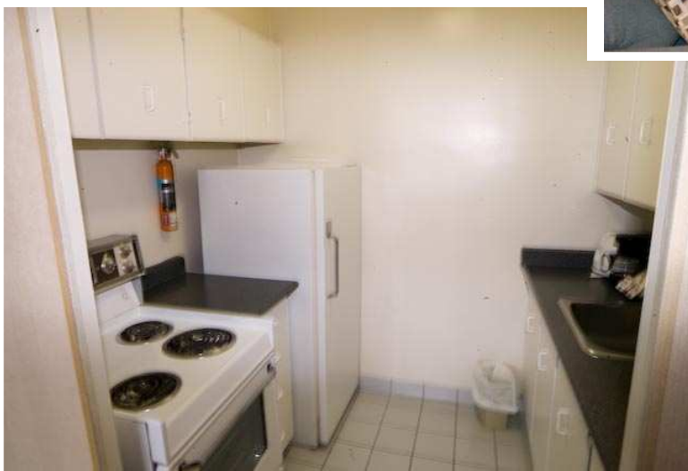
EN SUITE: KITCHENETTE and WASHROOM