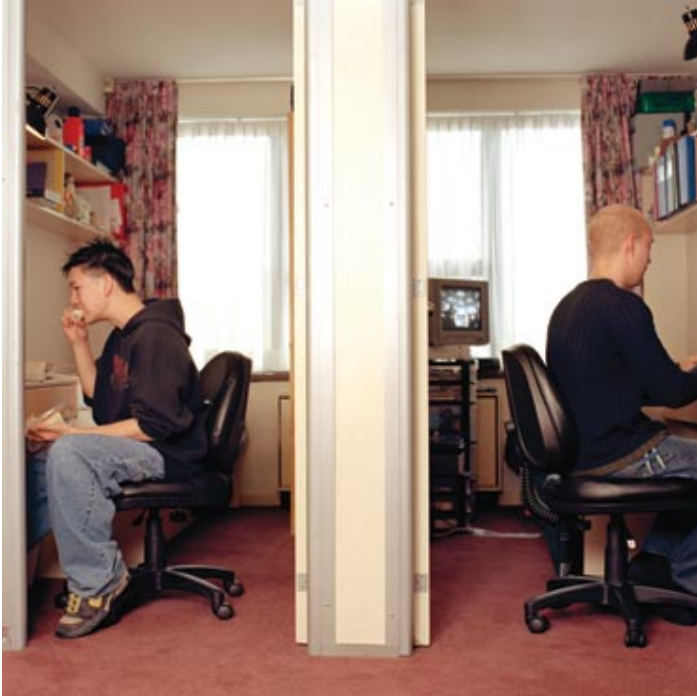
DOUBLE ROOM – with private sleep area