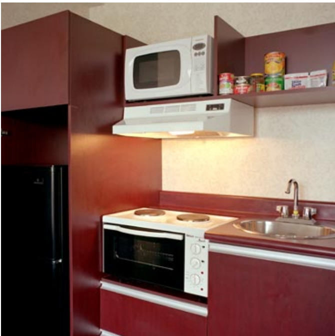
EN SUITE: KITCHENETTE and WASHROOM