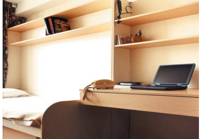
DOUBLE ROOM SLEEP AREA